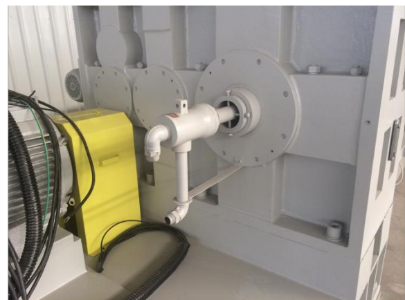
Fig 5: screw inside cooling

Now let's look at secondary extruder. The main purpose of secondary extruder is cooling, so the cooling capacity and the accuracy of temperature control are very critical, that will be the main factors to affect the physical property of the board. We are using tailor-made oil temperature controller to control the temperature of secondary extruder. All temperature control is digital setting, so it's foolproof. The cooling channel design not only has something to do with cooling efficiency, but also the safety of the barrel. One more secret I have to tell you that the screw inside cooling is very important as well. Fig 5 shows a rotary joint for screw inside cooling.