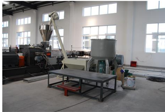
Fig 3: auger feeding system

Fig 3 is an auger feeding system. Auger feeding is much cheaper than the other two, but the accuracy, mixing and work environment is comparatively poor as well. Comparing with other two feeding system, auger feeding requires at least one more labor at feeding section, because workers have to weigh each material manually and put them into a pre-mixer. Then the pre-mixed materials will be transported to primary extruder by an auger loader.