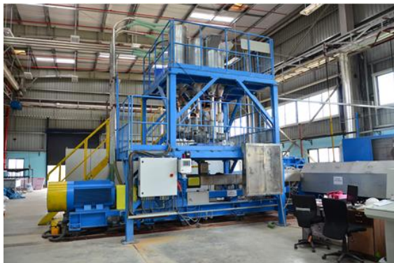
Fig 1: 7 components loss-in-weight feeding system

Well, let's get back to the machine. Normally, today's XPS line has tandem extrusion system, primary extruder plus secondary extruder in two stages. Either single screw plus single screw extruder, or twin screw plus single screw extruder. One stage twin screw extrusion system was out of date about 10 years ago.