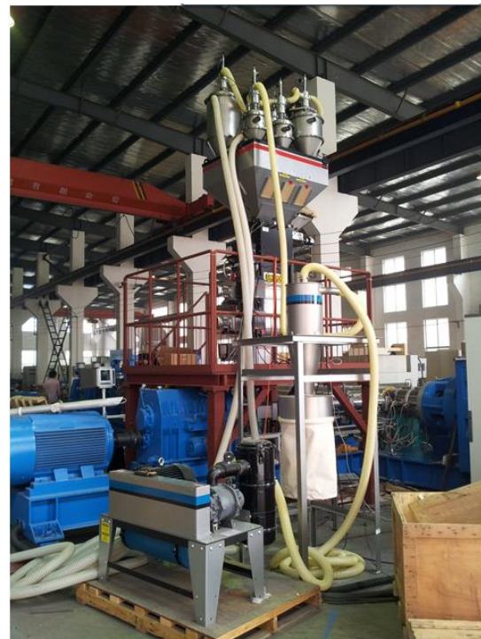
Fig 5: 7 components gravimetric Feeding system

Generally speaking, XPS production line is consisted of feeding system, extrusion system, die, and downstream. First of all, the feeding system. Mainly, there are three kinds of feeding system, loss-in-weight, gravimetric and auger feeding. They also have big difference in price. Fig 1 is 7 components loss-in-weight feeding system with vacuum loading system. In loss-in-weight feeding system, each material will be dosed and conveyed